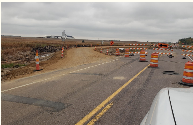
One of the traffic diversions.