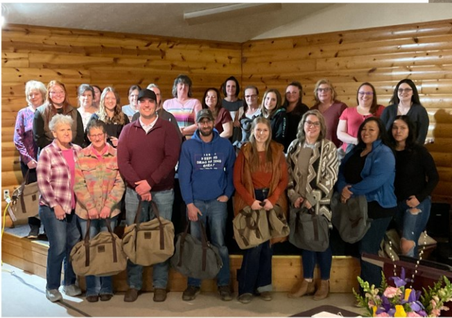
Spouse/Significant Other Award