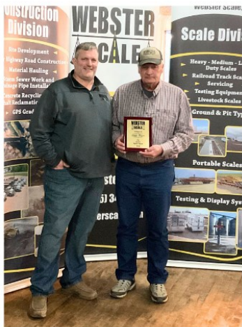
15,000 Safety Hours Layne Hagen *Not Pictured - Jamie Sturdevant*